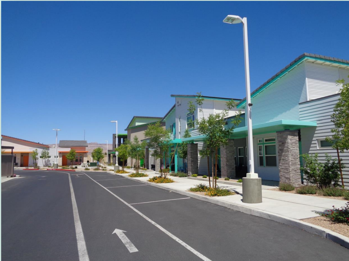
Opportunity Village – Betty's Village

U.S. Department of Housing and Urban Development